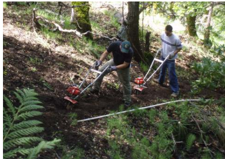
We fired up the two Mantis Tillers we packed in to show them the advantages of modern equipment.