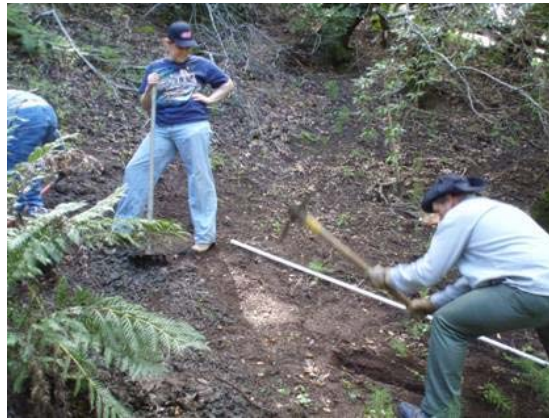
Ranger Bill gave us a demonstration of the back-breaking way grandpa use to do it, but there were no complaints from the crew about using the tillers.