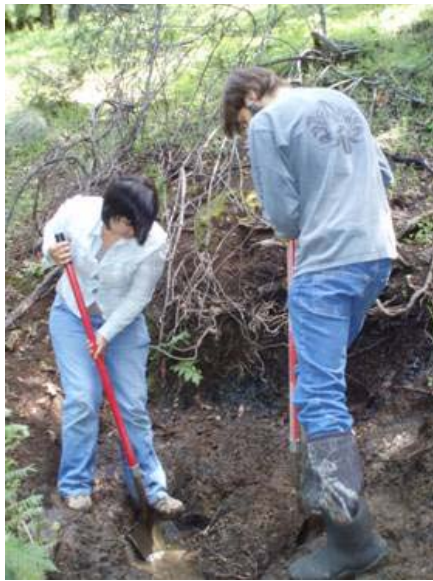
Part of the crew began digging out the new spring location.